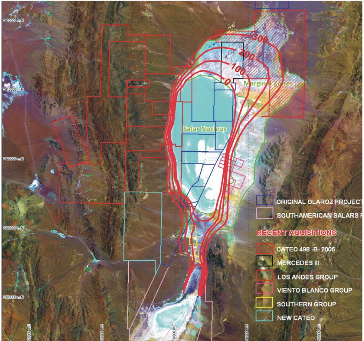
Figure 2 - Plan showing interpreted brine body at different depths based on AMT surveys and drilling.

The brine body is an oval shape with an approximate ratio of 2:1 (length to breadth) with the breadth having a distance of approximately 10kms. This is a good geometry from which to design a pumping strategy and bore field as compared to narrow geometries. The grades in the brine body are indicated by the results so far to be highest in the centre and decrease at the margins as the brine concentrations decrease. To the south towards Cauchari, the brine body narrows and grades decrease, influenced by the impacts of the Archibarca delta to the west.