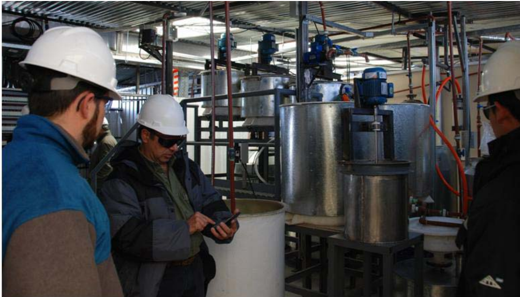
Process Development Facilities at Salar de Olaroz

During the quarter, the focus on the work was to optimise the process route to improve the purity of the product so that it can meet the high specifications required for the battery industry. Considerable advances have been made to this point both with work at the pilot plant and also at external laboratories. The Company's objective is the production of battery grade lithium carbonate from the facilities during this quarter. This can then be supplied to potential end users.