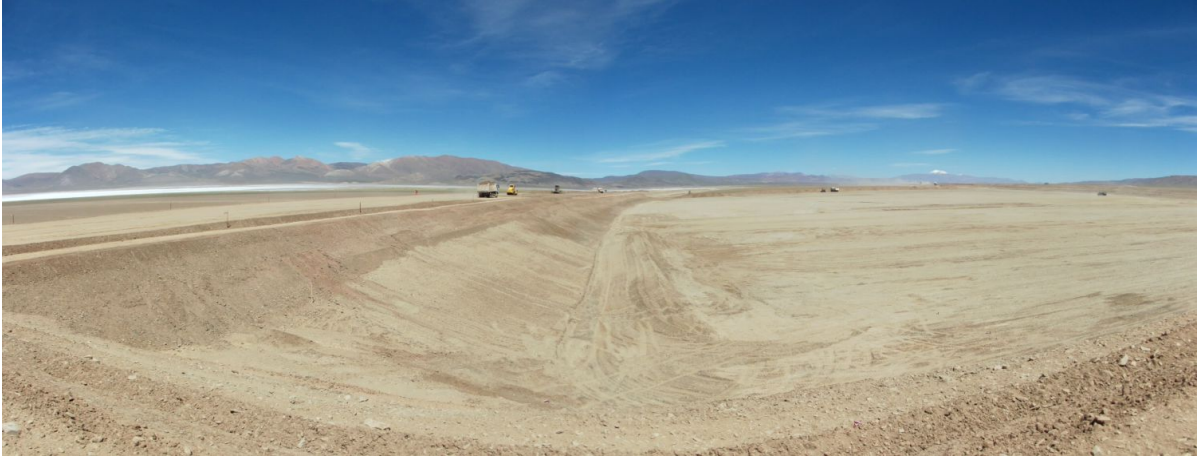
Evaporation pond nearing construction completion. The next step is to install the liner.