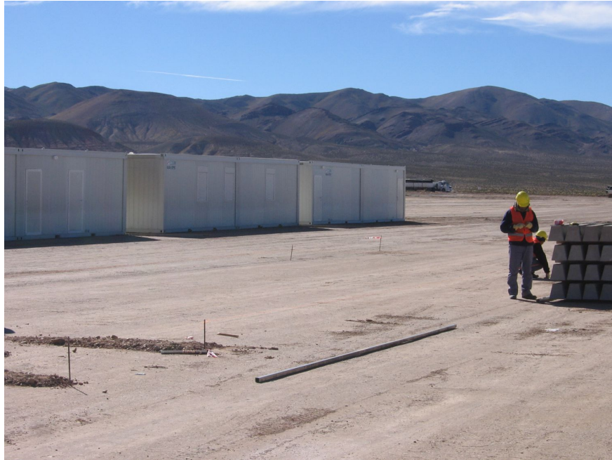
Camp accommodation under construction