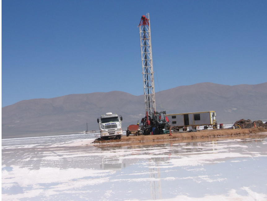
Drilling bore holes for brine wells on the salar