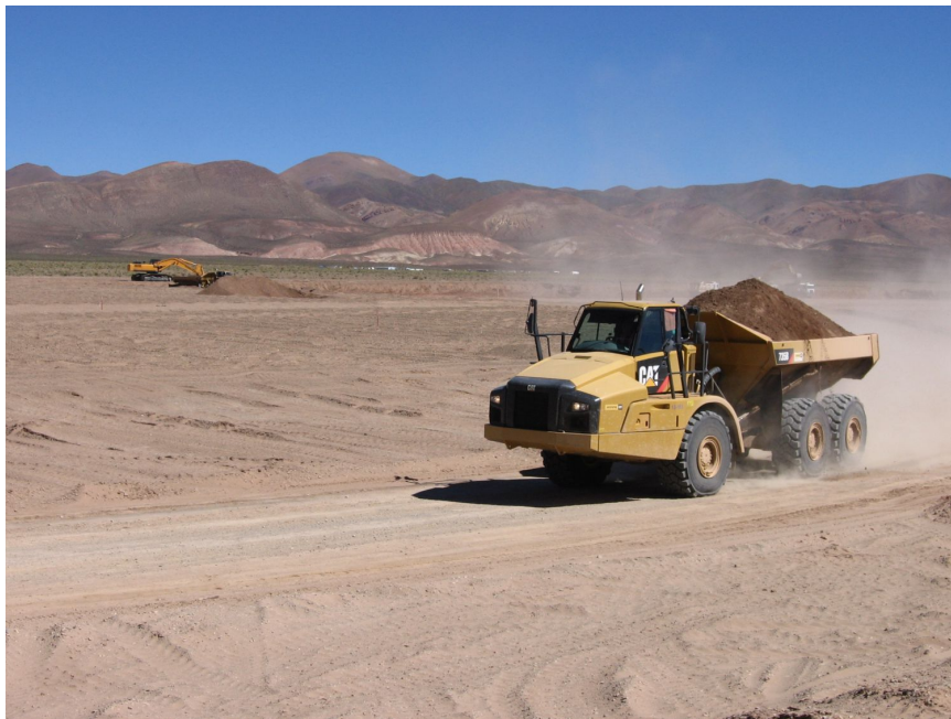
Making progress, on time and within budget