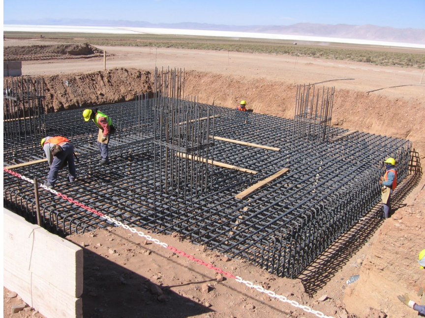
Liming Plant Foundations