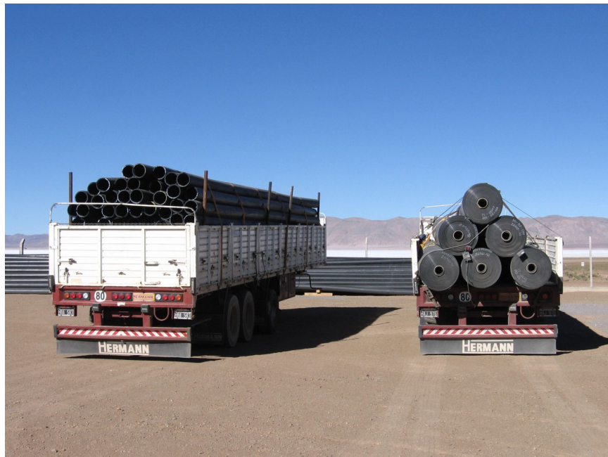
Pipes and liners for the evaporation ponds