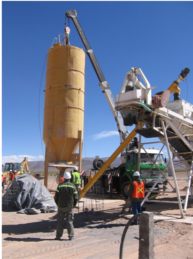
Silo installation for the effluent plant