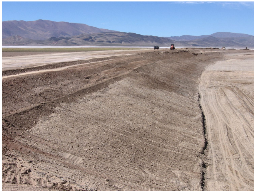
Internal road next to an evaporation pond under construction