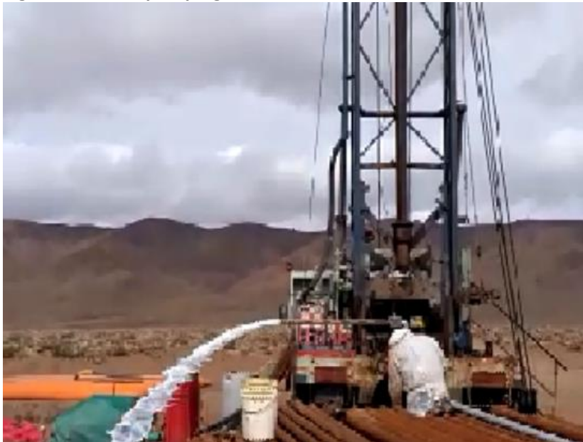
Figure 1: CAU07 pumping test