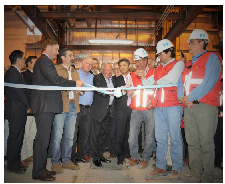
Ribbon Cutting Ceremony at Olaroz

Orocobre Limited (ORE:ASX, ORL:TSX) ("Orocobre" or "the Company") is pleased to announce that the official opening ceremony of the Olaroz Lithium Project was held on site at Olaroz on December 3, 2014.