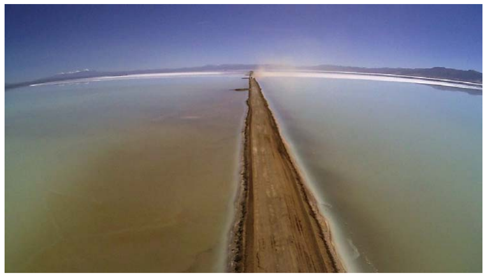
Road across the salar with the evaporation ponds in the distance

The construction of the Olaroz lithium project continues to advance according to schedule and within budget.