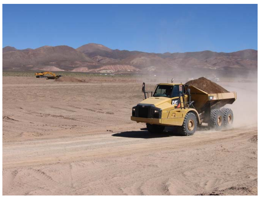
Continuing to make progress, on time and within budget