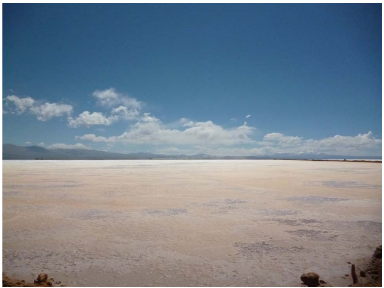
Road across the salar (in the distance)