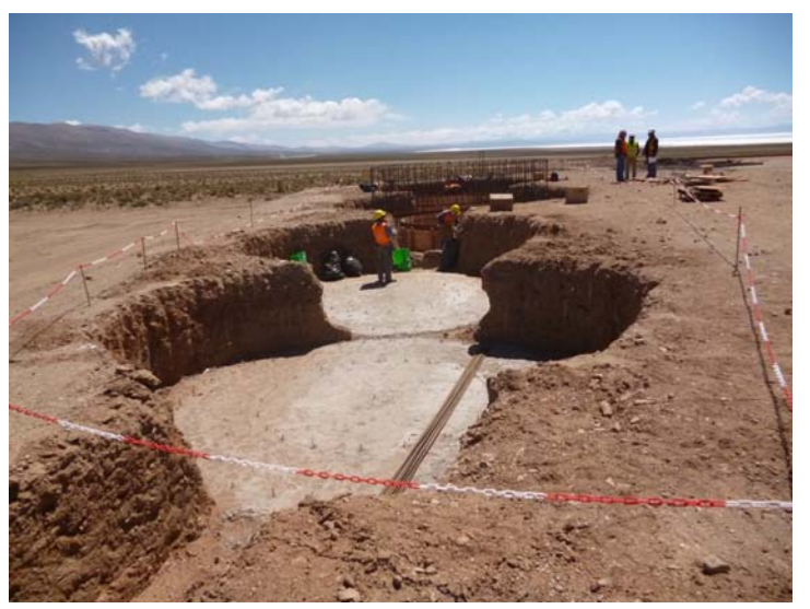
Foundations for Lime Plant Silos