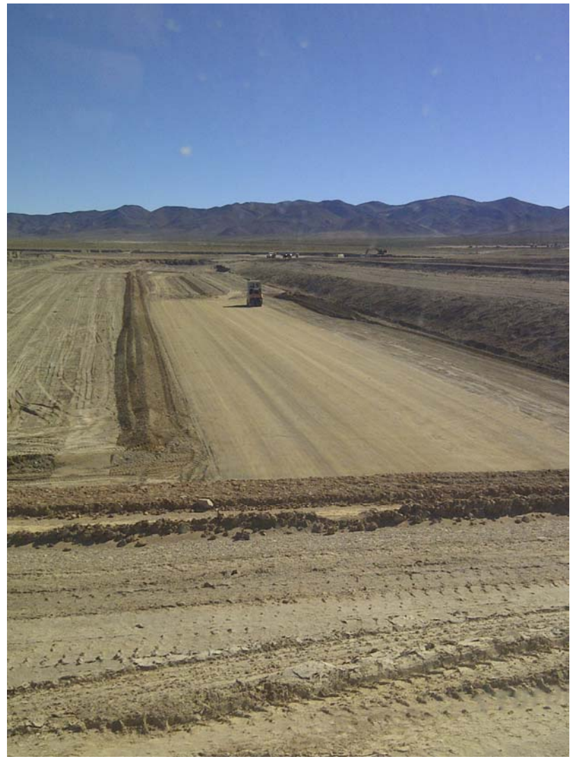
Evaporation pond under construction