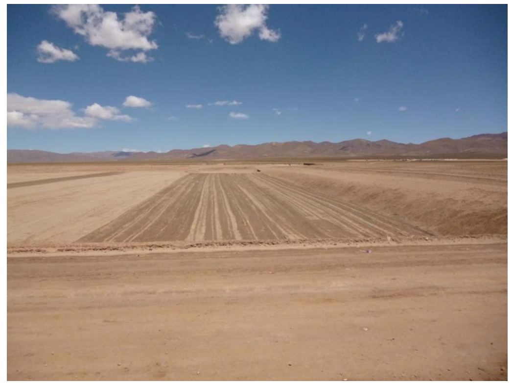
Evaporation pond under construction