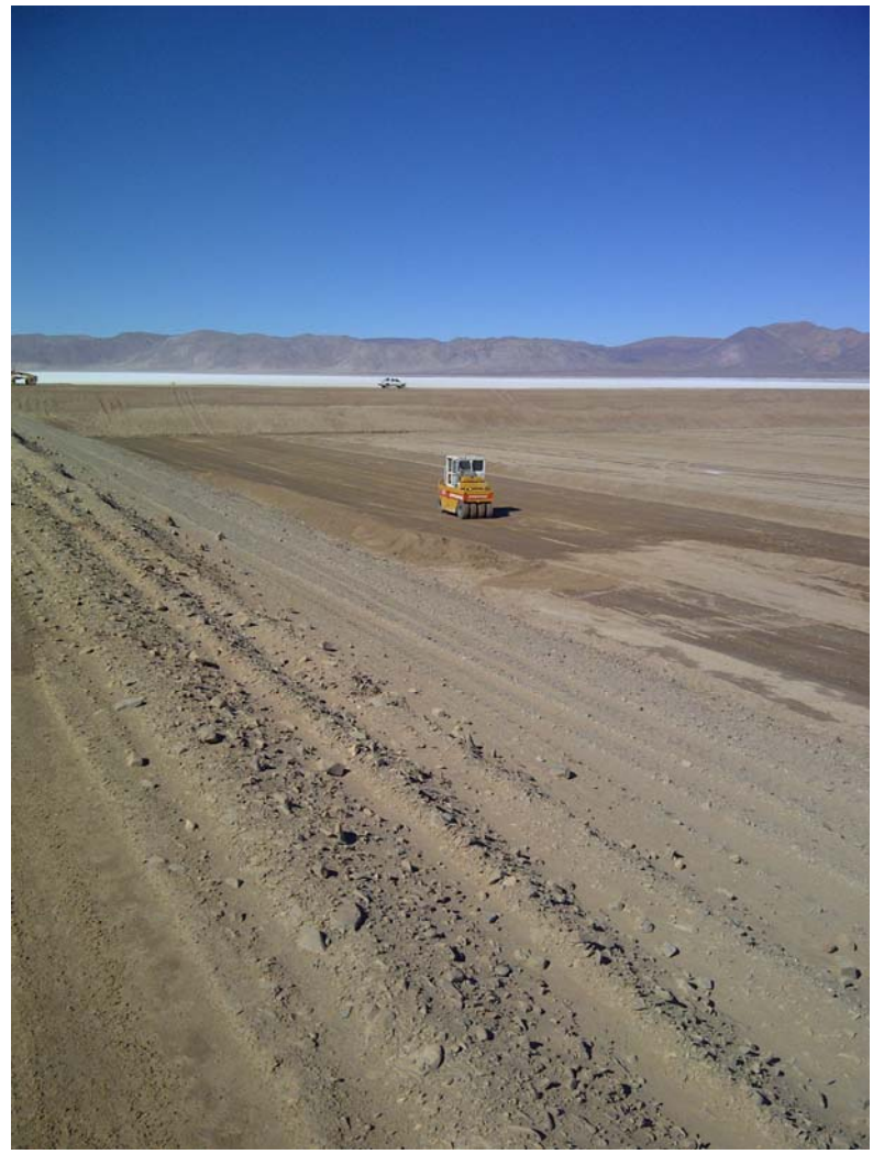
Evaporation pond under construction