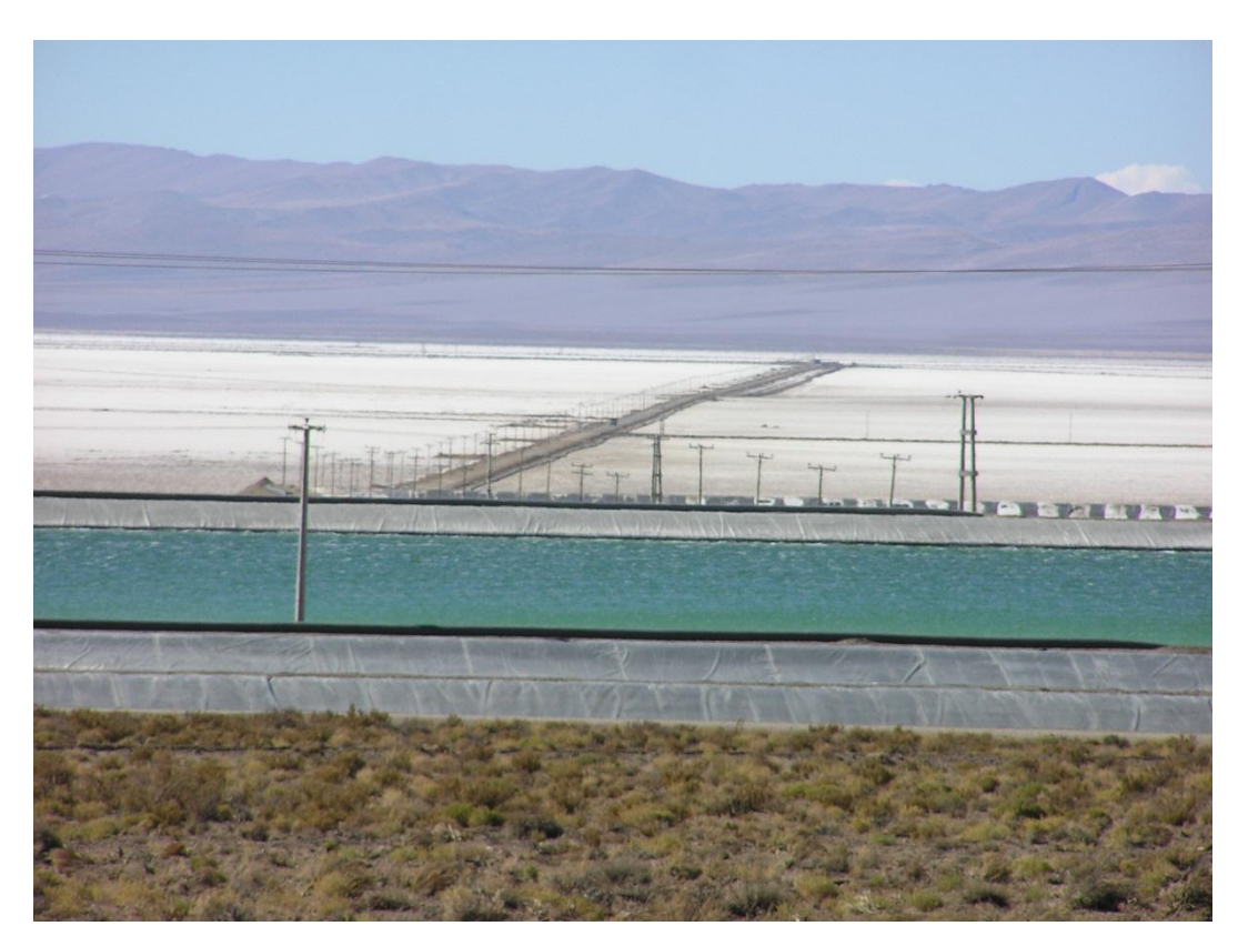
Brine holding pond and road across the salar