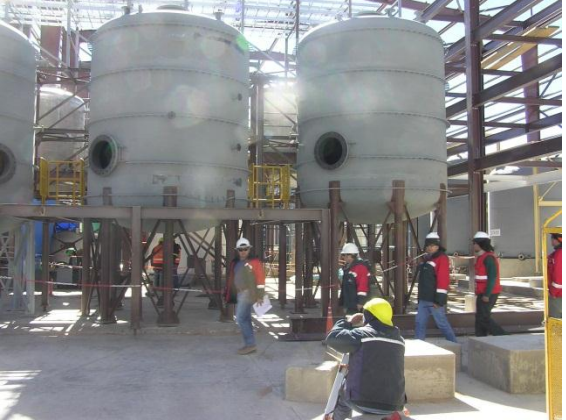
For more information on Olaroz please click here